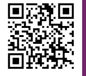
Hear Andy's full testimonial